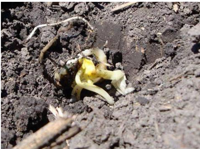
Figure 1. A corn seedling that suffered from chilling injury.

Imbibitional chilling injury can take place in both corn and soybean. The injury occurs when seeds take in water prior to germination as part of a process called imbibition or rehydration. In soybean, chilling injury seems to be related to how dry the seed is. If the water is cold from melting snow or a chilling rain, it can cause cell membranes to become rigid and rupture. This may result in damaged or aborted radicles, lower germination and delayed seedling growth (Figure 1). Such damage may limit or prevent nutrient uptake, restrict normal seedling development, and allow for soil disease and pest entry.